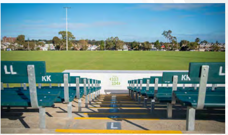
AND SEATING IN NEW PUBLIC STADIUM