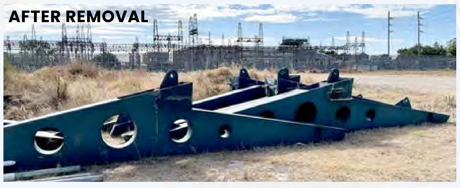
REPURPOSED STEEL FEATURED TO INSTIL THE HISTORY OF THE SITE

FROM THE ORIGINAL << OVAL ROOF STRUCTURE